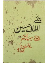
Noor Ali Chagani The Wall 1 , 2014 Price on Request